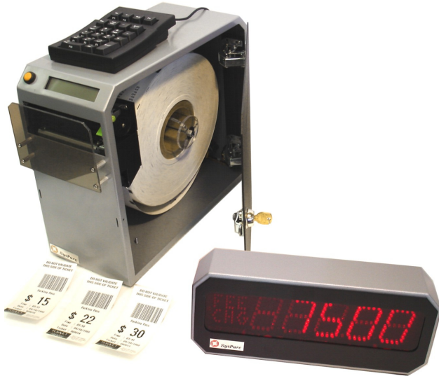
Model PD-3000- Pay and Display Dispenser