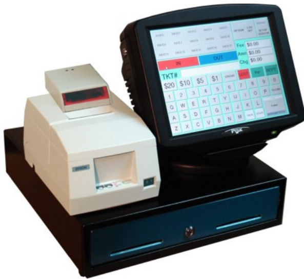
FC-4020 Touch Screen Fee Computer